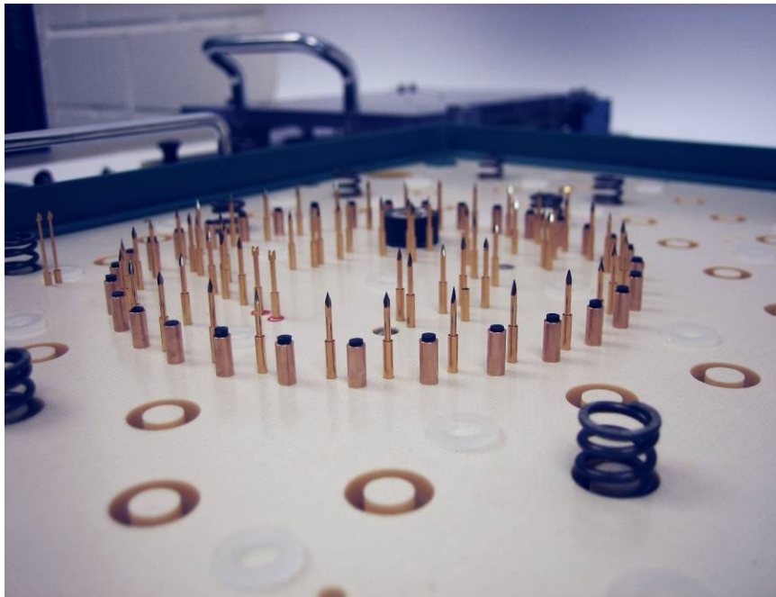
Figure 1: Assembly of receptacles for fiber optics and test probes

If for example LEDs are located at the board-outline with 90° angle of radiation, the optical signal can be transmitted to the evaluation device simply by a lateral guided optical fiber. But in many cases the LEDs to be tested on SMD-loaded boards are surrounded by test points and components and due to limited space conditions the adaption of the optical signal may become difficult. On the one hand, fiber optics have to be positioned very precisely, on the other hand the possible light incidence of neighboring LEDs has to be avoided. In this case one solution is the usage of special receptacles for optical fibers, guiding the fiber very close to the LED (fig. 1). If the LED is encircled extremely close by test points, a combined holder for fiber optics and spring contact probes can be a solution. Those combined holders can be realized down to 50mil grids.