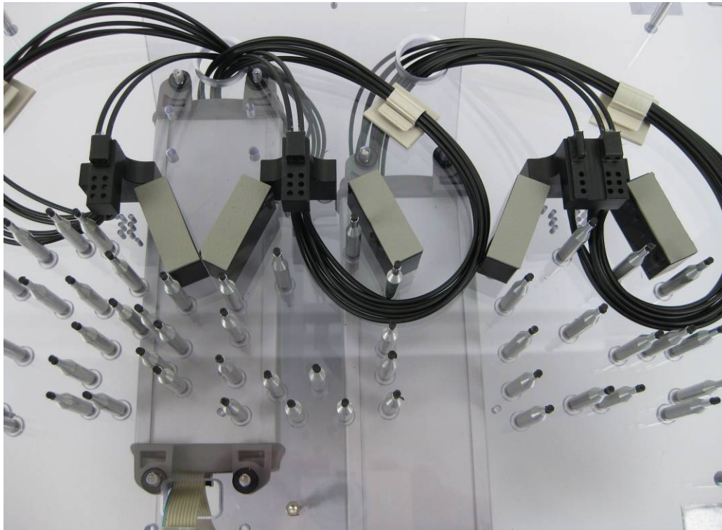
Figure 2: Customized test fixture with holders for fiber optics

For positioning the fiber optics directly to an LED segment and to avoid the incidence of extraneous light sometimes very individual holders for fiber optics are designed and manufactured (fig.2).